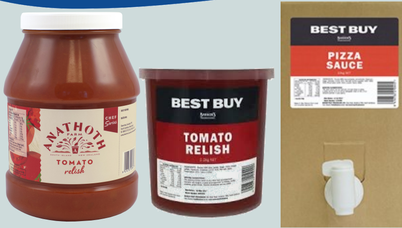
Anathoth Relish 2.55kg