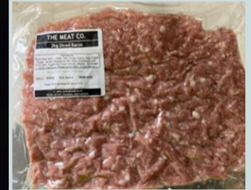
Diced Bacon 2kg pack (frozen)