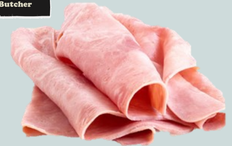
Metro Sliced Ham Catering size ( 3 x 1.3kg backs/box)