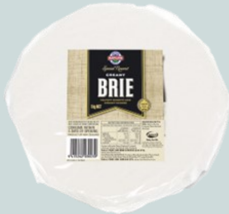
1kg Mainland Brie