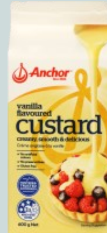
Anchor Vanilla 600gr