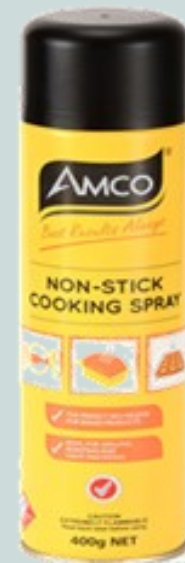
Canola Spray 400gr