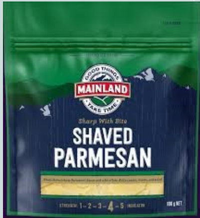
1kg Shaved or Shredded