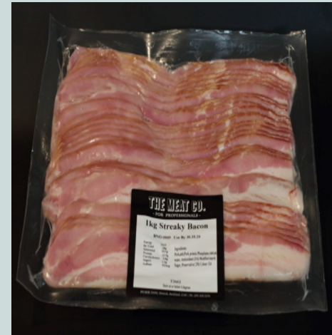
Streaky Bacon 1kg pack