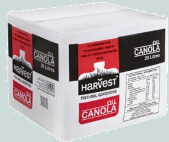
Harvest Canola 20 litres