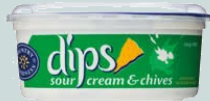
Sour Cream & Chives Cheese & Onion Kiwi Onion