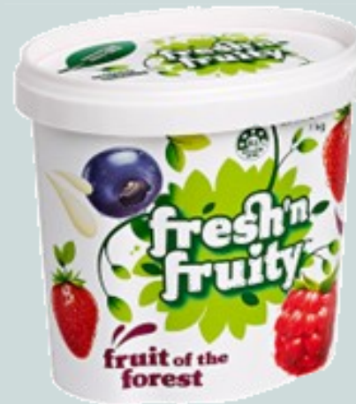
Fresh 'n Fruity Range 1kg or 6 pack