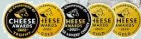
1kg Kapiti Kikorangi Blue