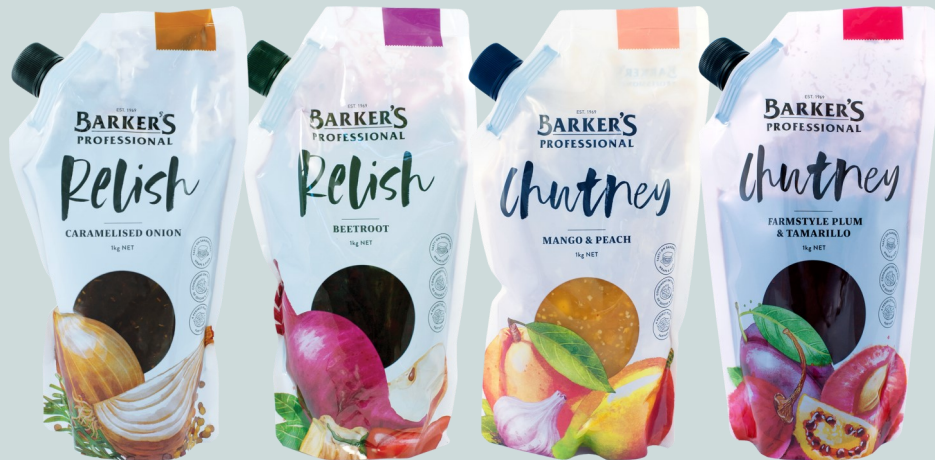
Relishes & Chutneys go online to see the full range