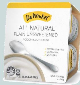
4 x 150gr